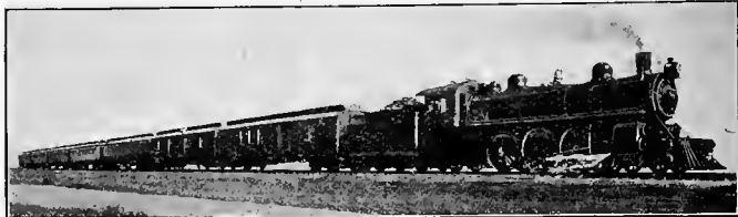
"Imperial Limited" Train. Montreal to Vancouver, 2,898 miles, 4½ days.

Only actual Transcontinental Line in America under one management